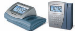
PYRAMID TIME & ATTENDANCE PAYROLL SYSTEMS

Pyramid Technologies, LLC 45 Gracey Avenue, Meriden, CT 06451 Toll Free: 800.336.3592 • Fax: 203.237.9497