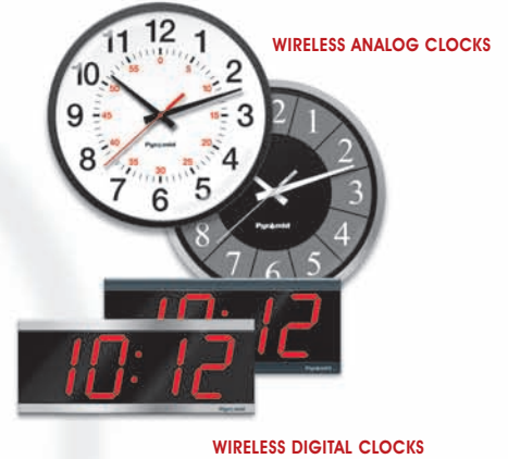
WIRELESS ANALOG CLOCKS